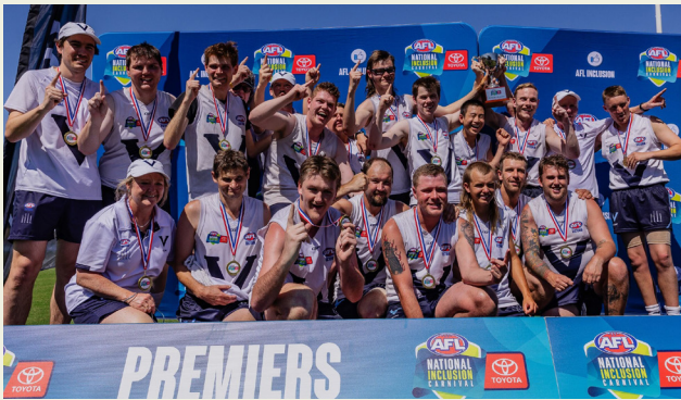
Division 2: Victoria- Country (58) defeated Queensland (25)