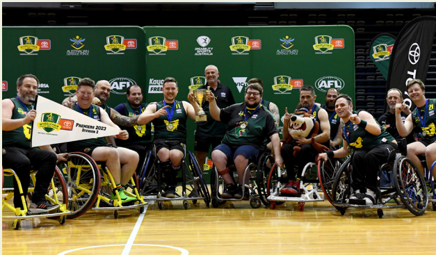
Division 2: Tasmania (82) defeated NSW/ACT (49)