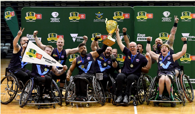
Division 1: Victoria- Metro (109) defeated Western Australia (52)