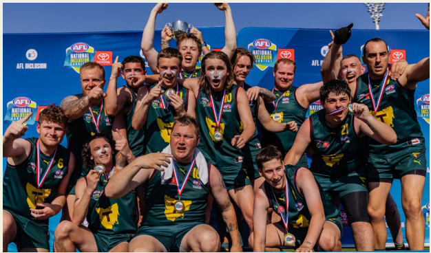
Division 1: Tasmania (34) defeated South Australia (30)